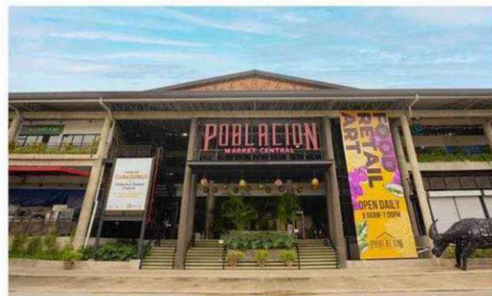
Poblacion Market Central