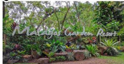
Malagos Garden Resort