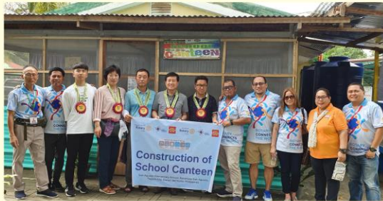
Construction of 1 Unit School Building at Brgy. Imelda, Laak, Davao de Oro funded by RC Oxted & Limsfield, United Kingdom in partnership with the Provincial Government of Davao de Oro.